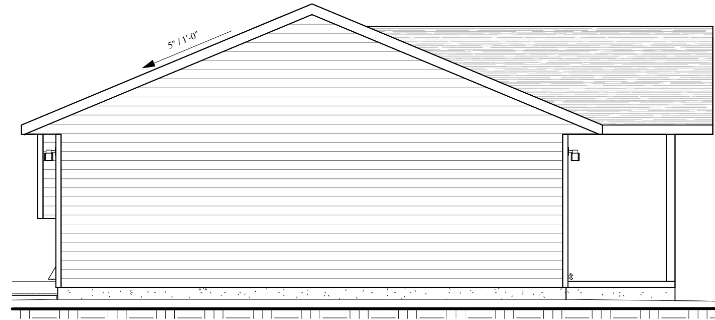
② Left 3/16" = 1'-0"