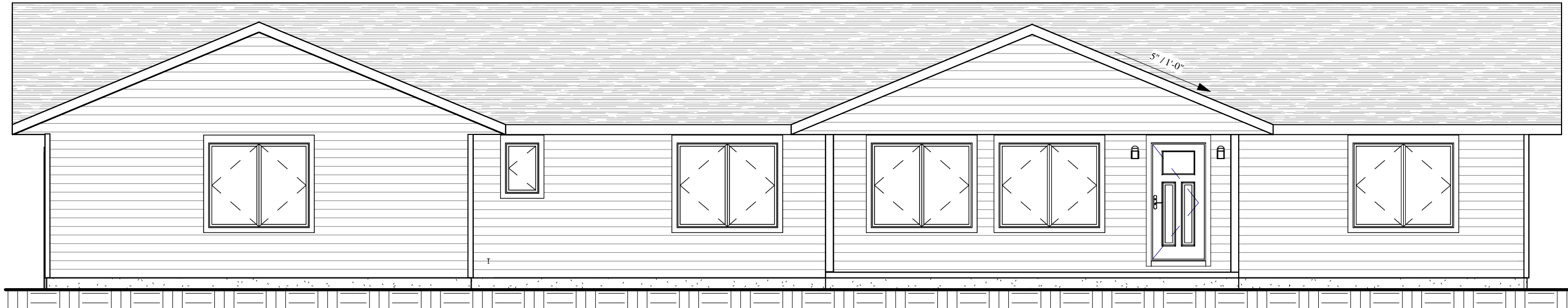
① Front Elevation 1 : 72