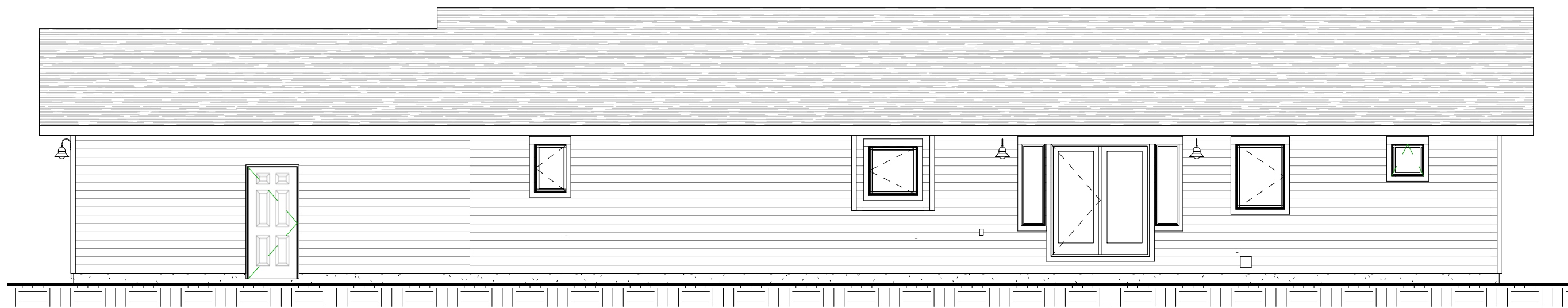
② Rear N.T.S.