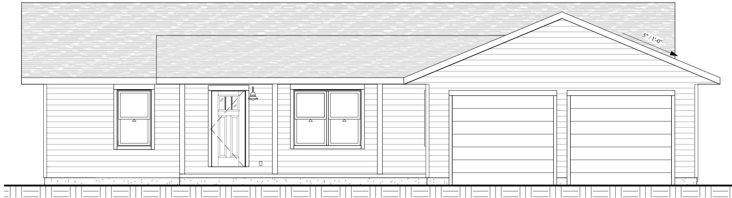
① Front 3/16" = 1'-0"