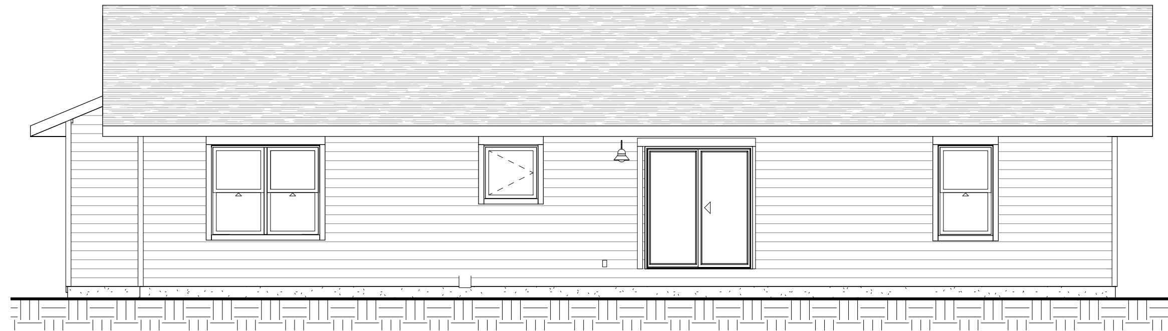
② Rear 3/16" = 1'-0"