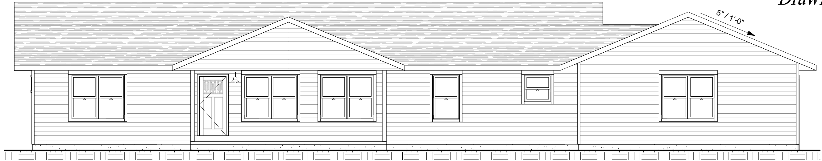
① Front N.T.S.