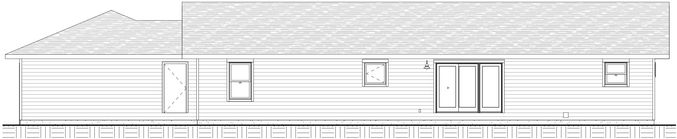
② Rear N.T.S.