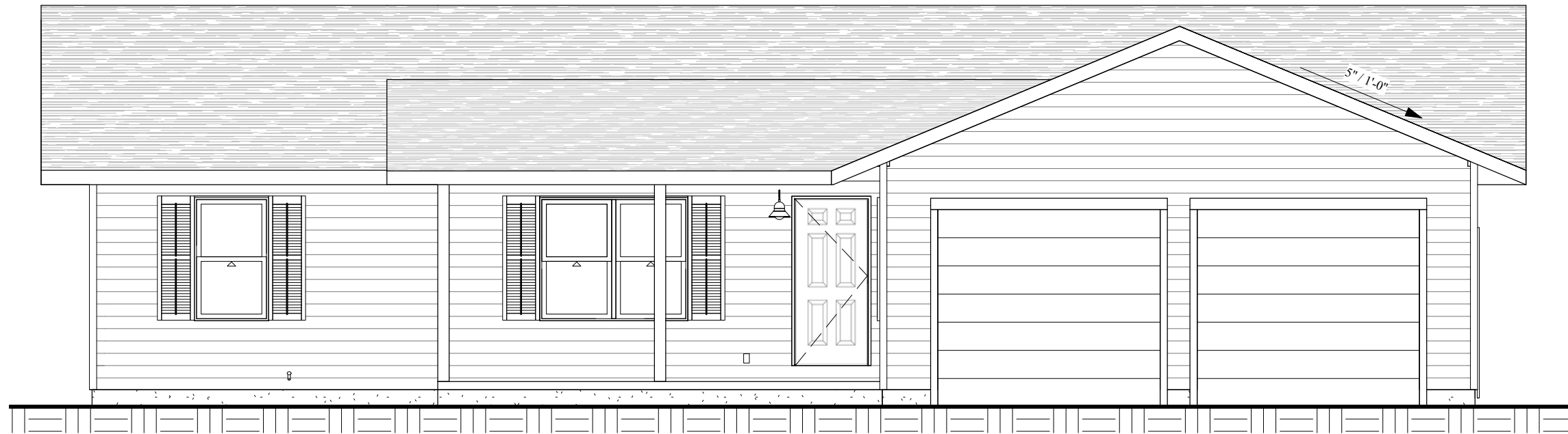
① Front 3/16" = 1'-0"