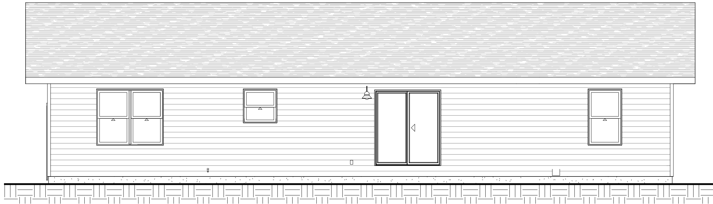
② Rear 3/16" = 1'-0"