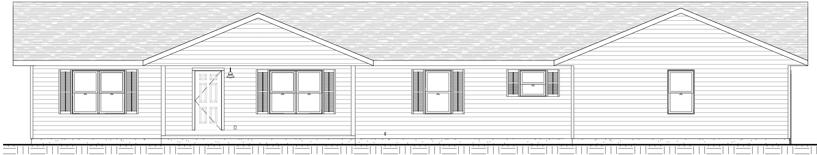
① Front NTS