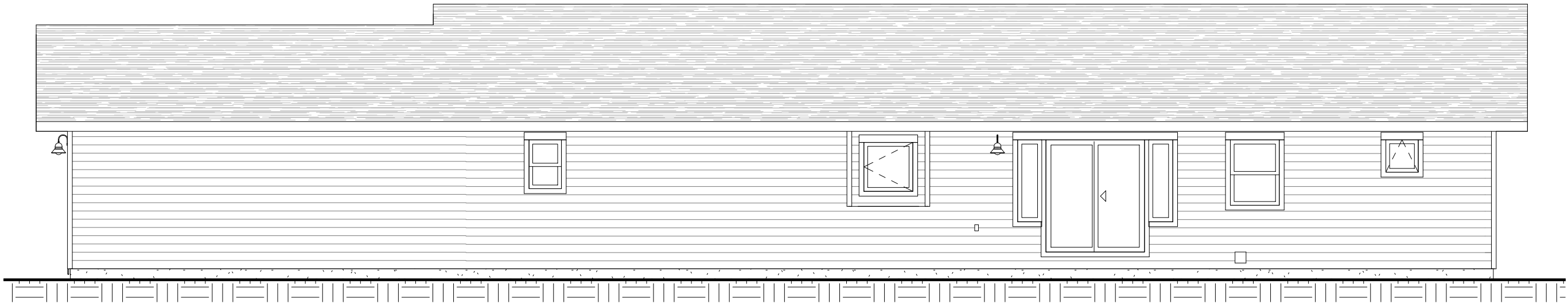
② Rear N.T.S.